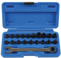
Low Profile Bit Set 1/4"D 20pc | 5914