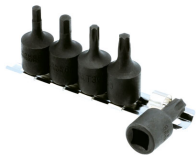
Brake Fixing Impact Bit Set 3/8"D | 8286